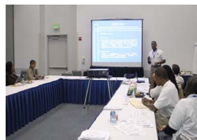
ALOM 2006, Anaheim, CA

information, please contact The Joshua Group at (404) 4559-6191.